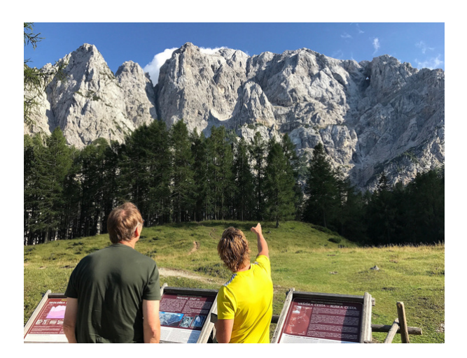
Day 3 TRIGLAV NATIONAL PARK - BOHINJ

We start the day with breakfast at the mountain hut, then lace up our hiking boots for a second day traversing through the pristine Triglav National Park to Bohinj valley. We meander along undulating paths with wide-open views of the green pastures and surrounding Julian Alps. The final part of the trek is through an evergreen forest, and the spongy trail is strewn with pine needles and honeycombs. We end the day transferring to our cozy hotel in Bohinj. The remainder of the day is free to relax and enjoy dinner on your own.