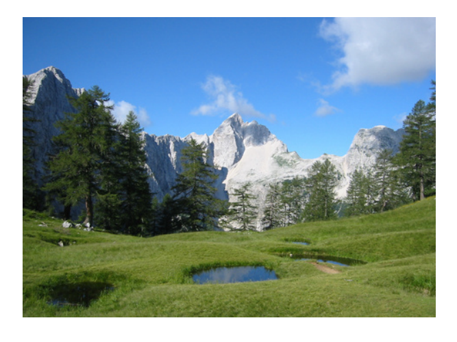
Day 2 LJUBLJANA - TRIGLAV NATIONAL PARK HIKING

This morning we leave the bulk of our luggage in storage at our hotel and carry a small overnight daypack with us for our 2 day trek to Triglav National Park. The day starts with a drive to one of the trailheads and from there we set off on a full day of hiking high above the village of Bohinj. The path ascends through an evergreen forest, eventually reaching the heart of the craggy Julian Alps. The terrain is mostly rocky today so expect lots of uneven ground. Once we reach the highest point of the day, the viewpoint of the Seven Triglav lakes will be below. It is a spectacular landscape of turquoise lakes, limestone peaks and giant boulders scattered across the surrounding area. Set in the middle is The Seven Lakes Mountain Hut where we spend the night in dormitory-style lodging.